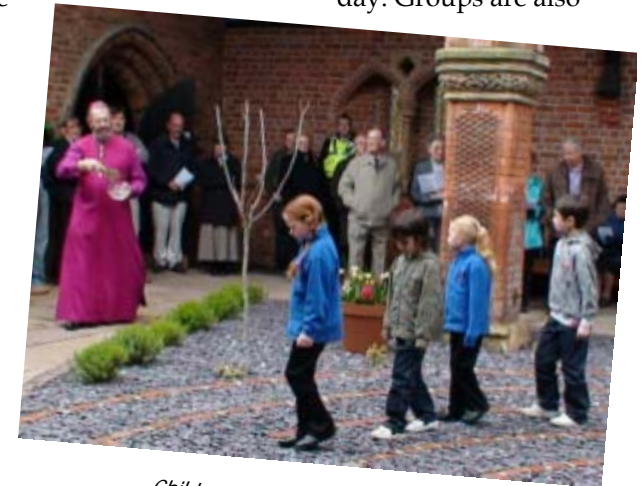
Children and Labyrinth sprinkled with holy water by the Bishop of Whitby

seen in and around the garden as a dedicated Godly Play room also overlooks the garden. As well as Godly Play sessions on Sundays a class from the school take part in Godly Play every week. Children often say "I love coming here". It is also an oasis for them as they often face difficult lives in this community, and a place where they are finding their own spiritual journey through Godly Play.