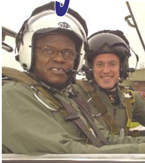
Airborne Archbishop: preparing for take off at RAF Linton-on-Ouse last year

I will jump from a plane at 12,500ft, with the Parachute Regiment Red Devils display team from RAF Langar near Nottingham. This will be my first parachute jump and I'm excited at the prospect. I am jumping, not for the title 'Skydiving Sentamu', but to raise at least £50,000 through this 'leap of faith' for a worthwhile cause.