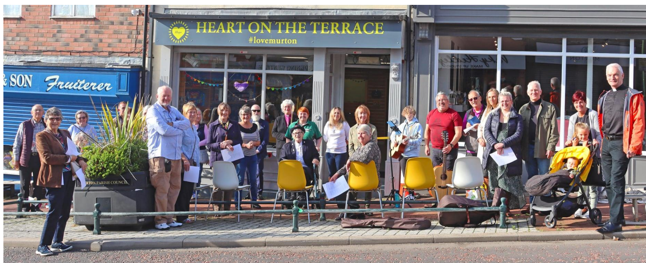
Photo of the opening of Heart on the Terrace

For more information on the Heart on the Terrace visit www.facebook.com/LoveMurton